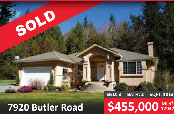
7920 Butler Road

BED: 2 BATH: 1 SQFT: 980 $59,900 MLS® 12969