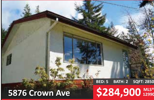
5876 Crown Ave

LOT SQFT: 47,916 (1.1 ACRES) $109,900 MLS® 12874