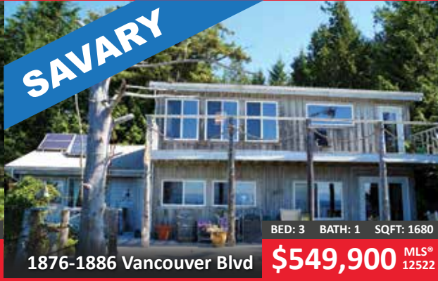
1876-1886 Vancouver Blvd

BED: 3 BATH: 1 SQFT: 1680 $549,900 MLS® 12522