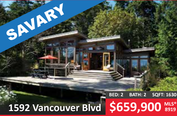
1592 Vancouver Blvd

BED: 5 BATH: 2 SQFT: 2850 $284,900 MLS® 12990