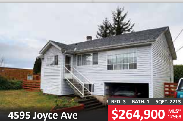
4595 Joyce Ave

BED: 2 BATH: 1 SQFT: 810 $264,900 MLS® 12962