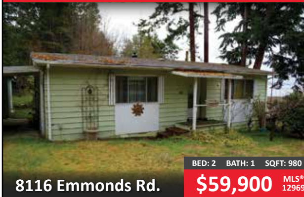
8116 Emmonds Rd.

BED: 2 BATH: 1 SQFT: 980 $59,900 MLS® 12969