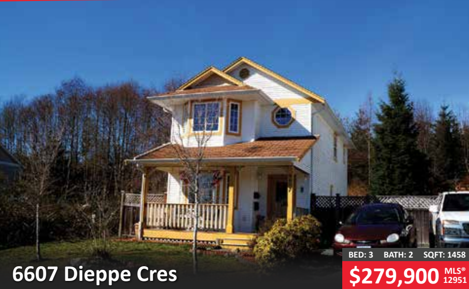
6607 Dieppe Cres

BED: 4 BATH: 3 SQFT: 2427 $334,900 MLS® 12953