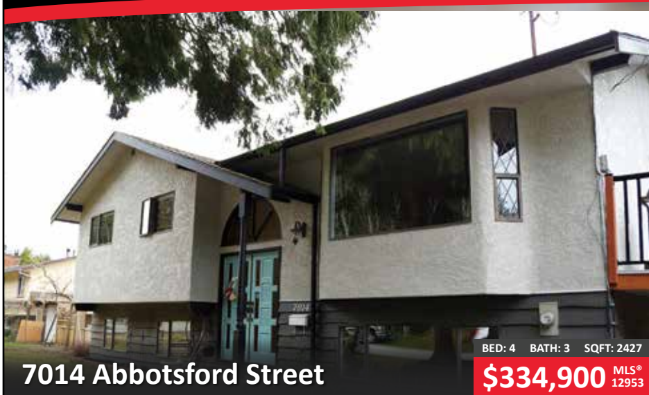
7014 Abbotsford Street