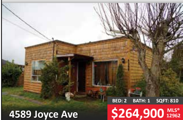
4589 Joyce Ave

Also upstairs, a large laundry room and four piece bathroom. Landscaped lot is fully fenced, and the covered front porch and private back patio are great for outdoor livin'.